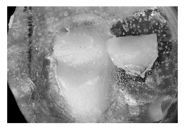
Fig 3. Severely damaged porcelain after debonding. Note the large amount of porcelain remaining on bracket base.

The present study showed that the SBS of stainless steel brackets bonded to porcelain is highly influenced by both the porcelain conditioning technique and by the type of adhesive used for the bonding procedure. These results are in agreement with previously published data.<sup>9-14</sup>