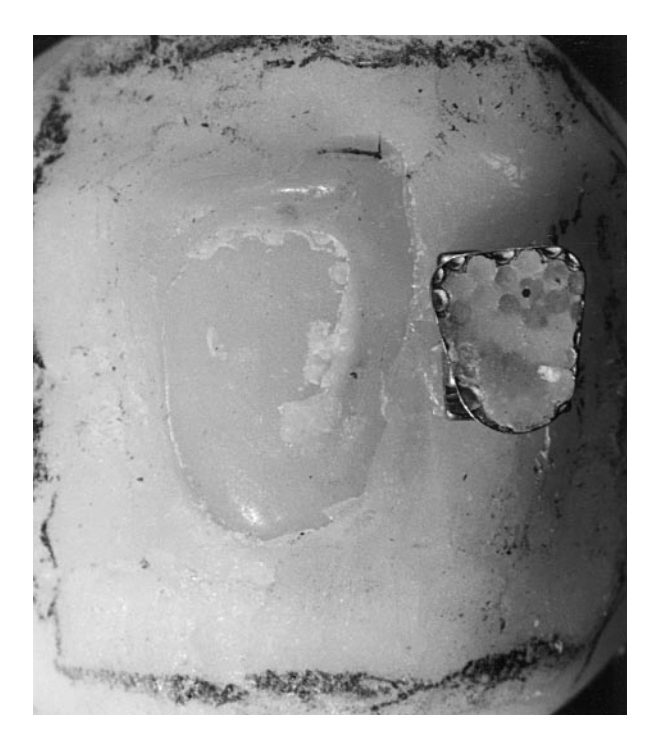
Fig 4. "Clean" cohesive bond failure. Note small amounts of adhesive remaining both on porcelain and on bracket base. No observable damage to the porcelain.

When restoring with porcelain, emphasis is focused on esthetics therefore debonding orthodontic brackets